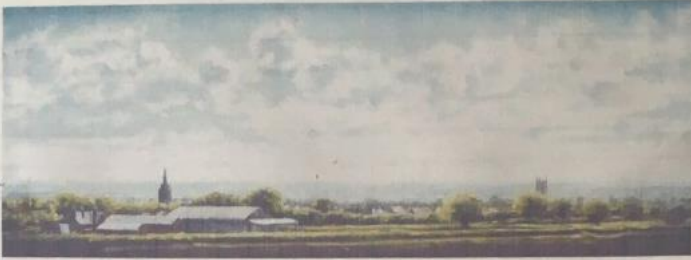
From Harstonby Over Morton to Crowland

We have been so delighted to see so many photos of what you have been doing at home over the past few weeks, and to find out when you have been inspired about some of the work you have been asked to do... We will be choosing a year group each week to feature in our newsletter.